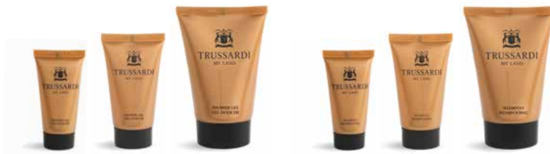
SHOWER GEL My Land

INTENSE AND TIMELESS SENSUALITY: Cashmeran, Vetiver, Leather, Tonka Bean