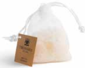
BATH SALTS My Land

4 jar 8 ml / 0,3 fl.oz: Lip Balm, Hand Cream, Night Cream, Day Cream