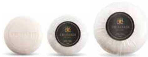
PLEAT WRAPPED SOAP My Land