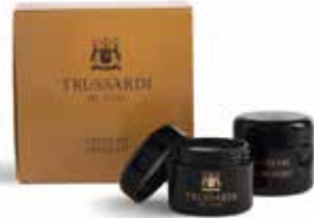
CREAM KIT BOX My Land

4 jar 8 ml / 0,3 fl.oz: Lip Balm, Hand Cream, Night Cream, Day Cream