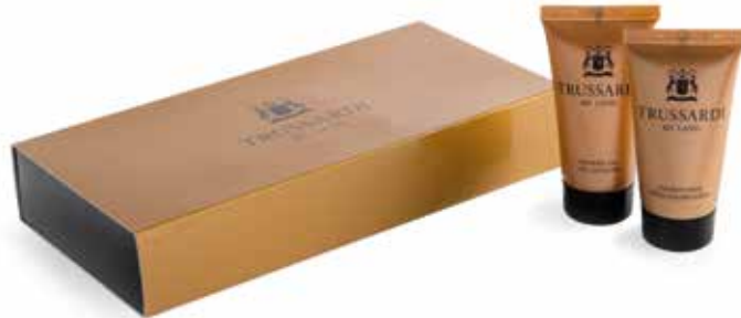
GIFT BOX My Land

4 Tubes 30 ml / 1 fl.oz: Shower gel, Shampoo, Conditioner, Body lotion, 2 Soap 25 gr / 0,88 oz