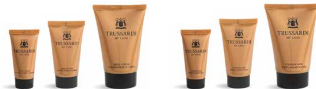
BODY LOTION My Land

30 ml / 1 fl. oz 50 ml / 1,69 fl. oz 100 ml / 3,38 fl. oz