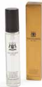
PERFUME My Land