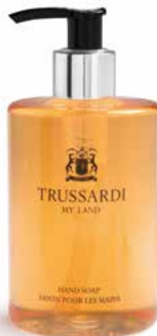
HAND SOAP, HAND & BODY CREAM SHOWER GEL, SHAMPOO, CONDITIONER

4 Tubes 30 ml / 1 fl.oz: Shower gel, Shampoo, Conditioner, Body lotion, 2 Soap 25 gr / 0,88 oz